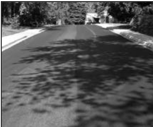
Sidewalk Replacement/Road Resurfacing: before and after.