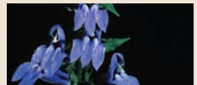
Great Blue Lobelia